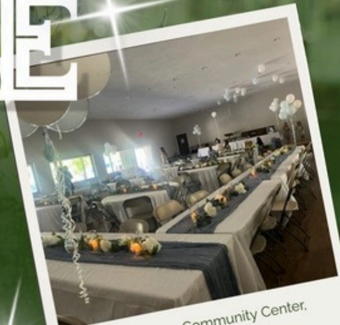
Robert Hootman Community Center, Running Springs, CA 92382