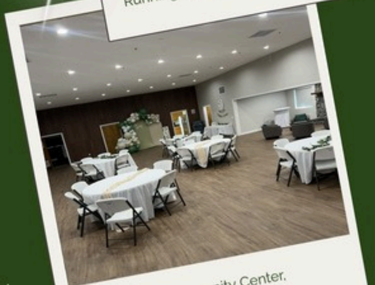
Twin Peaks Community Center, Twin Peaks, CA 92391