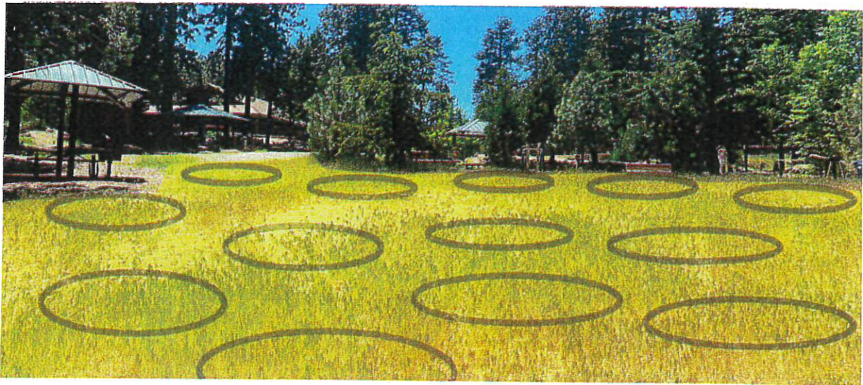
Image: Looking west towards the Community Center. Marked areas created by the over layed ellipses are examples that indicate the possible spacing of fruit trees. The diameter indicates the maximum growth of the fruit tree branches. Spacing will be no less than 12' apart in all directions.