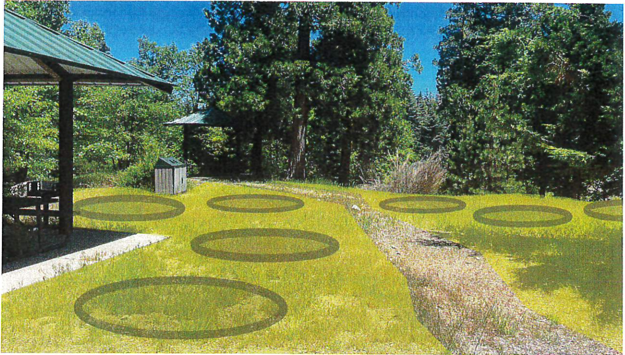
Image: Looking east towards the forest. Marked overlays indicate the spacing of selected fruit trees. The diameter of the ellipses indicates the maximum growth of the fruit tree branches. Spacing will be no less than 12' apart in all directions from the center.