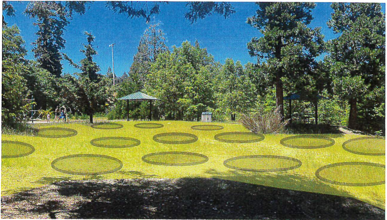
Image: Looking north towards the play area from the community food garden. Marked overlays indicate the spacing of selected fruit trees. The diameter of the ellipses indicates the maximum growth of the fruit tree branches. Spacing will be no less than 12' apart in all directions from the center.