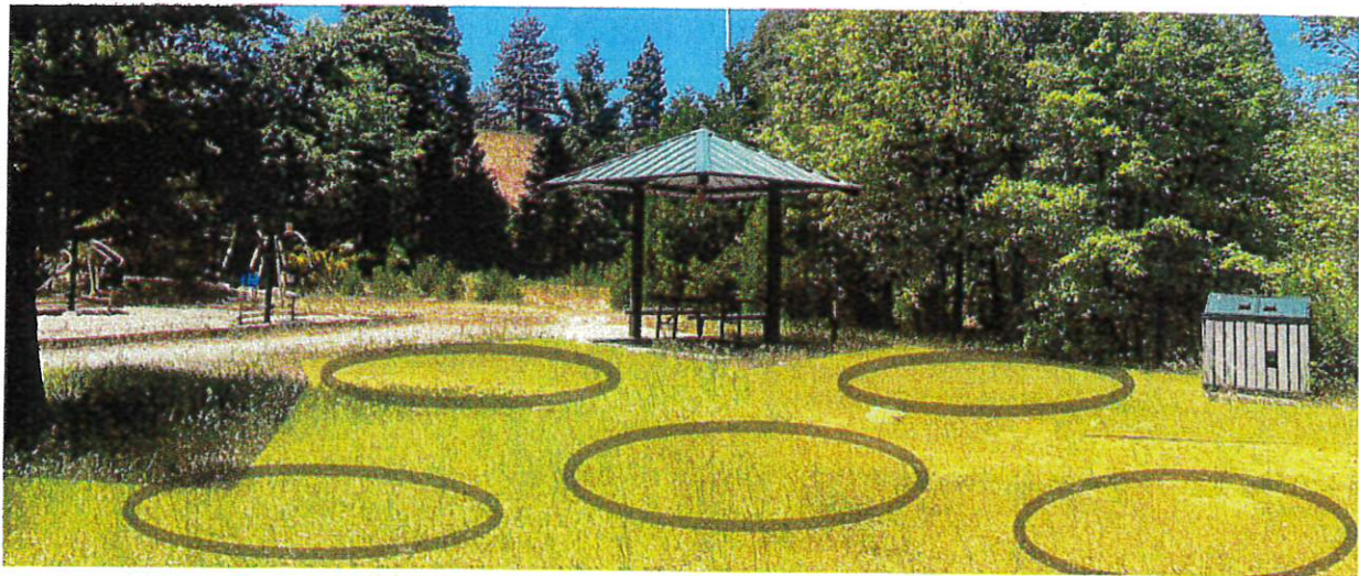
Image: Looking north from the center of the proposed public fruit orchard. Marked overlays indicate the spacing of selected fruit trees. The diameter of the ellipses indicates the maximum growth of the fruit tree branches. Spacing will be no less than 12' apart in all directions from the center.