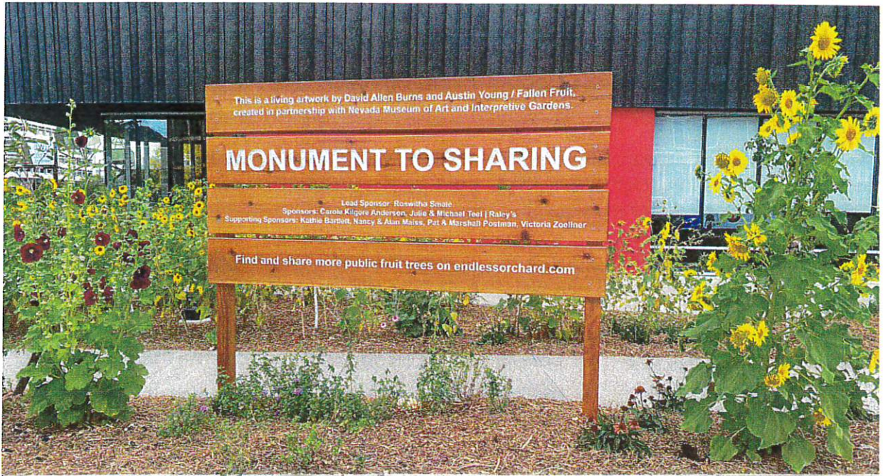
Image: Drawings for signage for Nevada Museum of Art in Reno, Nevada. This is only a sample of language from a recent project and does not reflect the final language for the Twin Peaks Garden Learning Center project.